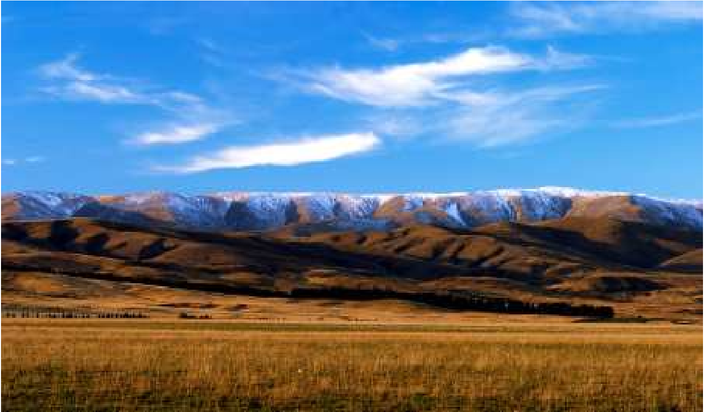
Photo: The Hawkdun Range, an iconic Central Otago landscape and one of Forest and Bird and FMC's "six pack" of parks.

Forest and Bird's Canterbury/West Coast field officer, Eugenie Sage will give an illustrated talk on Forest and Bird and FMC's "Six Pack of Parks" proposal for six new high country parks and current high country issues. The South Island high country east of the Main Divide has spectacular landscapes, distinctive plants and wildlife and abundant opportunities for recreation. Yet few areas are protected as parks and reserves. Current issues include the need for changes in the tenure review process to better protect lands with high conservation and recreation values; and increasing demand for water for irrigation which threatens braided rivers and some of these special landscapes and wildlife.