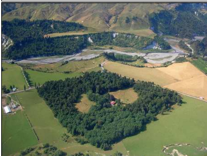
Te One homestead, site of the award winning work!!

how large or how small, acknowledging each person is unique in the contribution they can make: some are more limited physically than others. All are welcome.