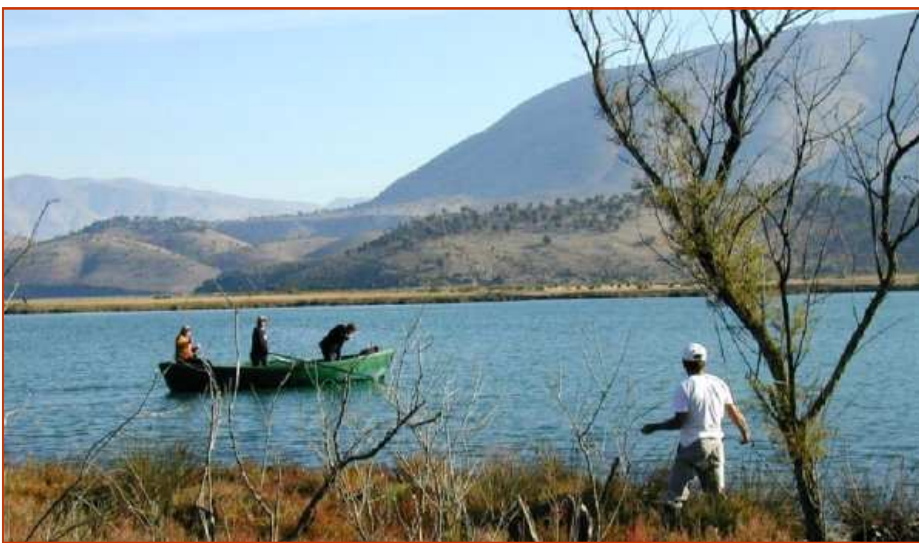
The Lake Butrint Ramsar and World Heritage Site, Albania; a fine example of a wetland recognized by the Ramsar Convention.