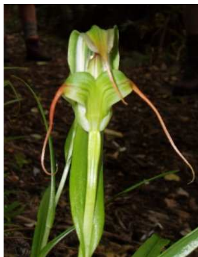
Pterostylus , one of the native orchids we saw

Under the able leadership of Vic Vercoe, a primary goal for the group was to see some fantastic New Zealand native orchids in bloom. Vic has a keen eye for these wee beauties, and with his help a number were spotted!